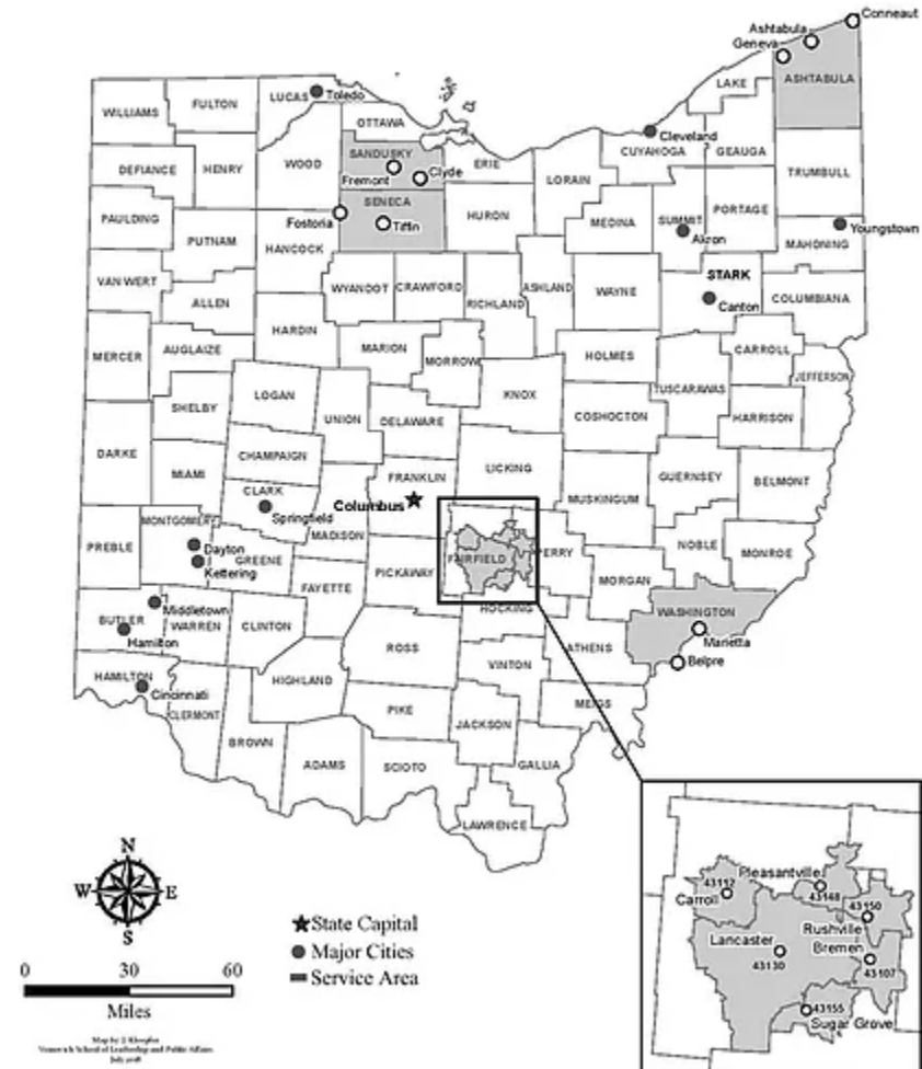
Map of Service Area Served by the Consortium