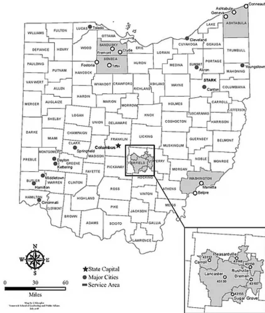
Map of Service Area Served by the Consortium